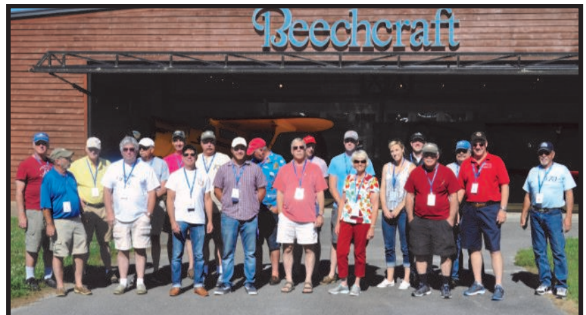
Fly-out to Beechcraft Museum — Tullahoma, TN