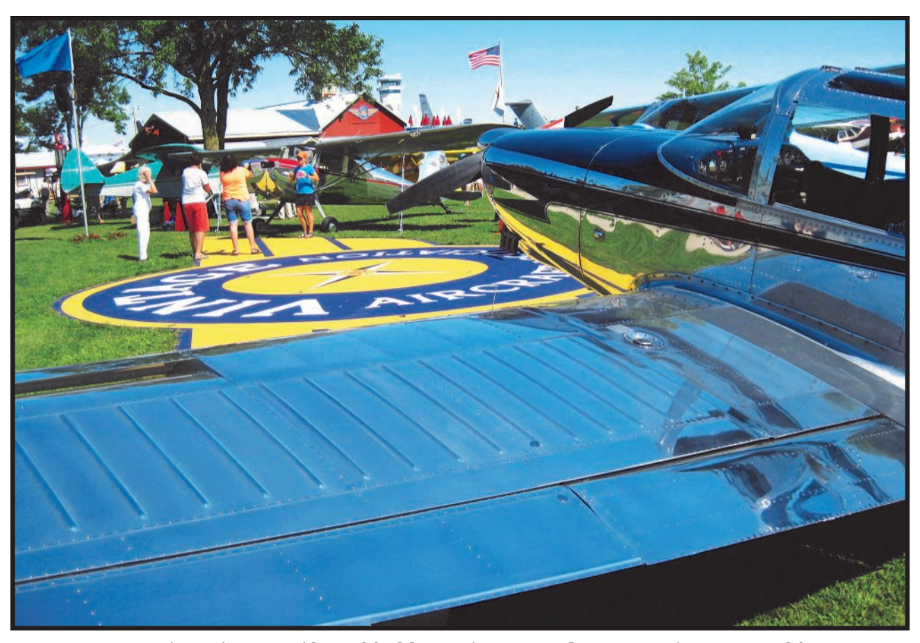
Janet Dicker's beautiful N80733 on display at Oshkosh AirVenture 2017 The following link will take you to more pictures of EAA KOSH 2017. https://www.icloud.com/sharedalbum/-B0CGrhkPxgYzTH