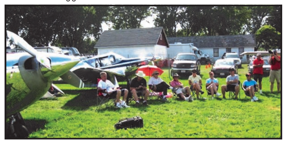
The afternoon fellowship at the flight line during the airshow.

It is fact, a true pilgrimage of aviators travel each year to Oshkosh, Wisconsin for the annual EAA AirVenture Experience. We have had a strong Swift Type Club presence for many years and our support for EAA (Vintage Aircraft) has not gone unnoticed. This year was no exception. We hosted two forums, had a Swift featured in the Ladies Love Taildraggers theme, and had our week long presence at the Type Club Hangar. The fellowship at the flight line is fantastic and has proven to be the meeting ground for the afternoon airshow.