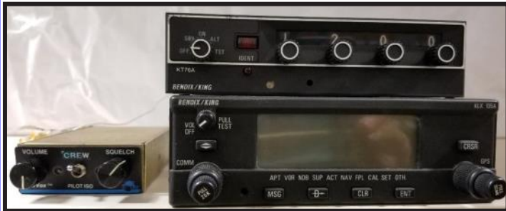
King KLX 135A GPS/Comm

Photos below as mentioned on page 1. — Contact Swift Parts for more details.