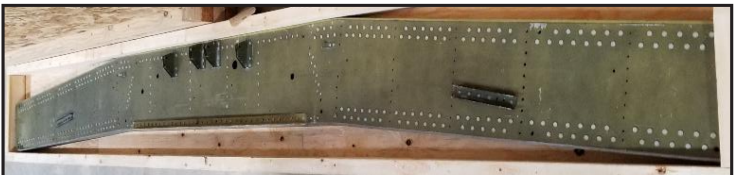
Center Section Main Spar with an undrilled Lower Cap