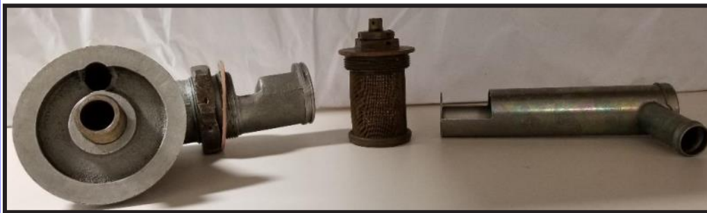
Oil Filter Adapter