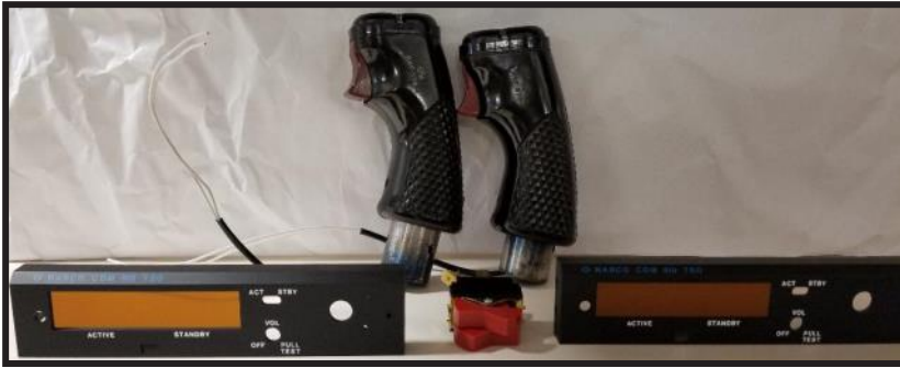
Narco Face Plates only