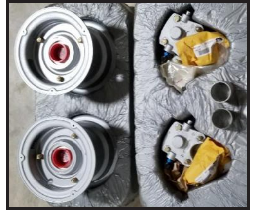
New Cleveland Brakes