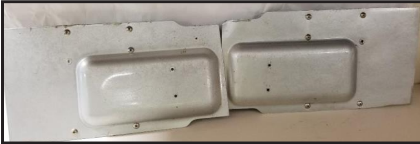
Original Gear Doors