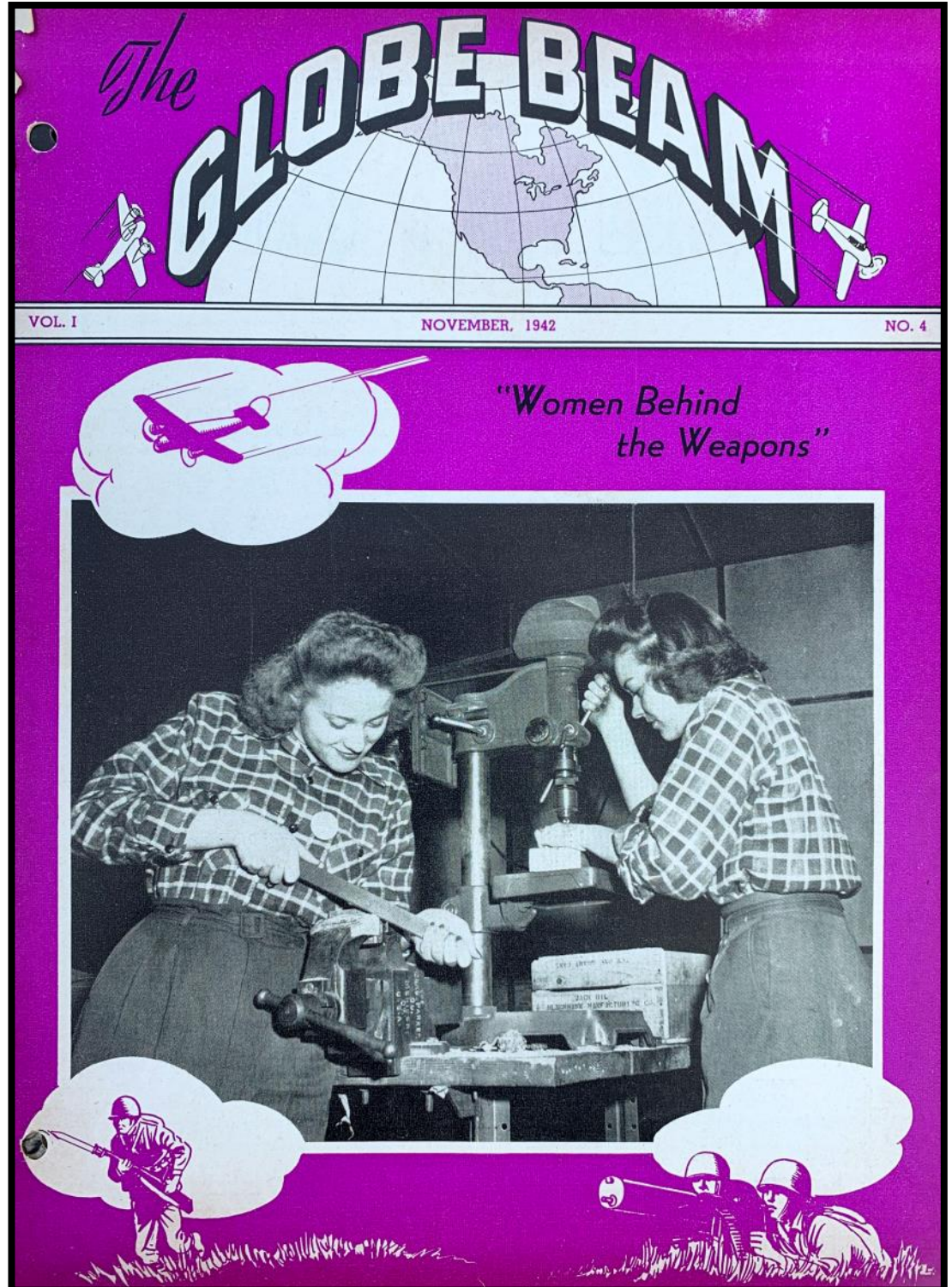
The cover of the November 1942 “Globe Beam.”

The “Globe Beam” magazine, the in-house publication of Globe Aircraft during WWII, provides priceless insights into life at the Globe factory between 1942 and 1945. This month we’ll look at the “better half” of the Globe Aircraft workforce...the women whose contributions made possible the production of 600 AT-10 twin-engine trainers between 1942 and 1944. Working side-by-side with their male counterparts, these ladies were members of a team of over 2,200 workers at Globe.