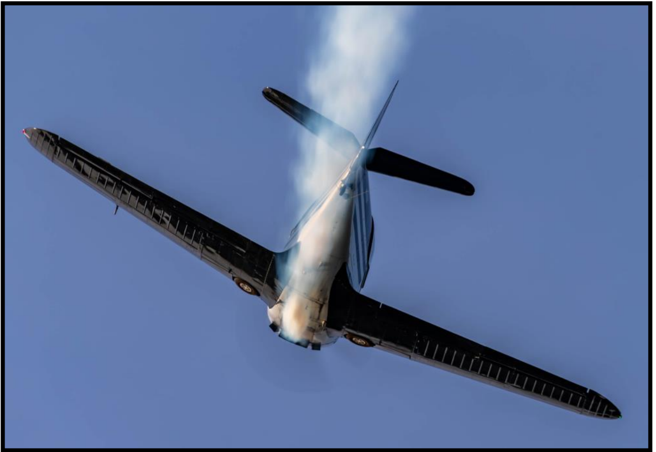
Another great photo shared by Will Campbell on the Globe Temco Swift Facebook page.