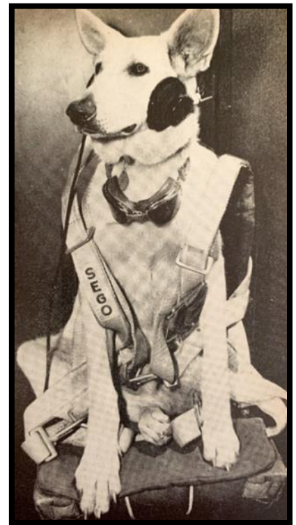
Flight Test mascot, “Sego.”