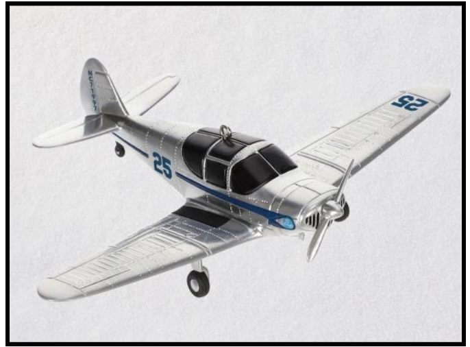
Hallmark 2021 Ornament

This Christmas is definitely the “Year of the Swift”!