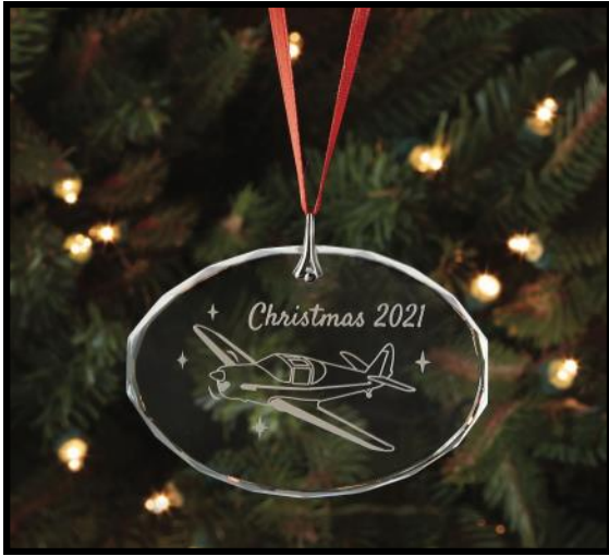
Sporty's 2021 Ornament