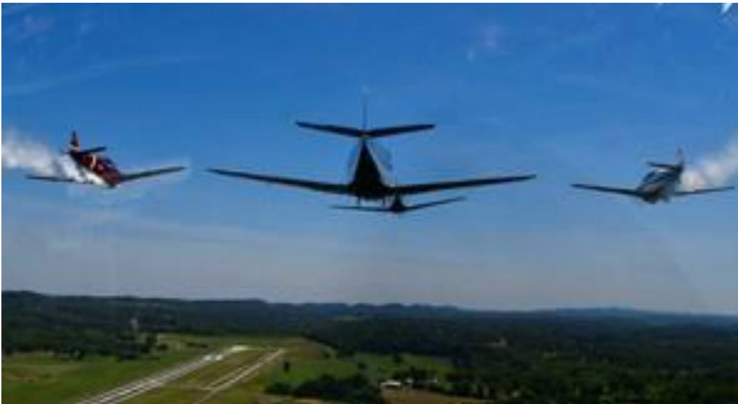
Two really nice 2018 formation shots

I can't tell you how impressed people are when they ride along and see how well we do with so little verbal communication. So, keep practicing those hand signals. Make the Swift community and FAST proud...stay proficient and don't forget the all important briefings.