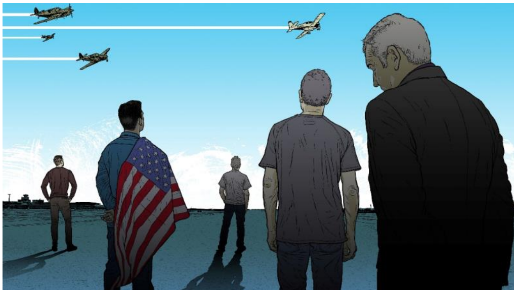
Illustration by Jan Feindt

Memorial services are often downers, but this was so much better than sitting in a rented hotel or restaurant banquet room or, worse, a funeral home. Small airports are foreign to so many. Nonflyers marvel at the magic that pilots revere. The western sky beckoned beyond the hangar door as more than 80 people gathered to remember Charlie.