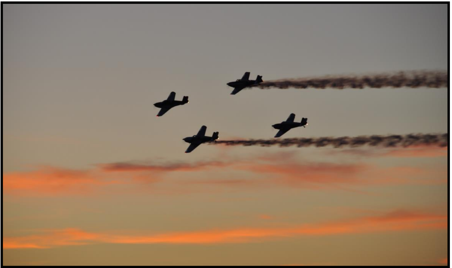
Beautiful sunset formation shot from our 2017 Swift National — Cleburne, Texas