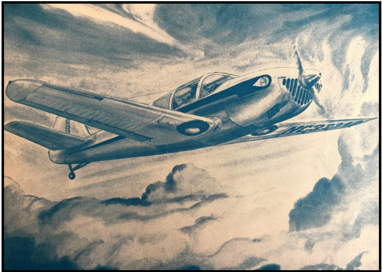
A dynamic Eugene Clay watercolor used in Swift advertising. (See story Pgs. 3-5)